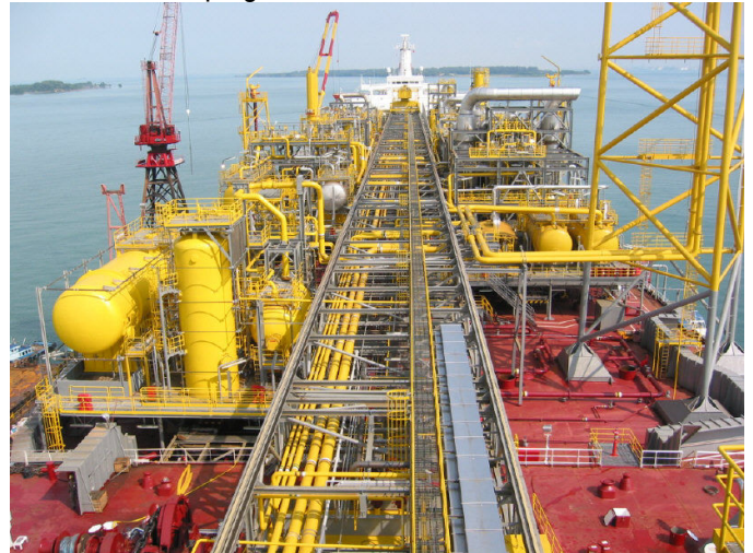
Tanker being converted to an FPSO.

But fundamentally these are still ships, with all of the attendant need to understand collision, stability, mooring and station keeping.